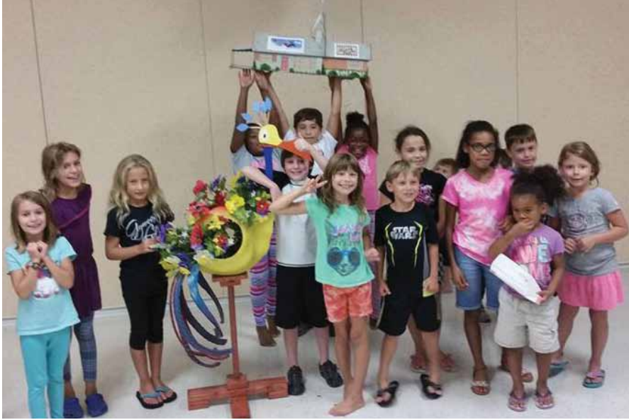
The kids enjoyed making crafts -- and showing them off!