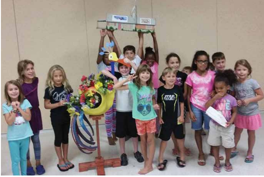
The kids enjoyed making crafts -- and showing them off!