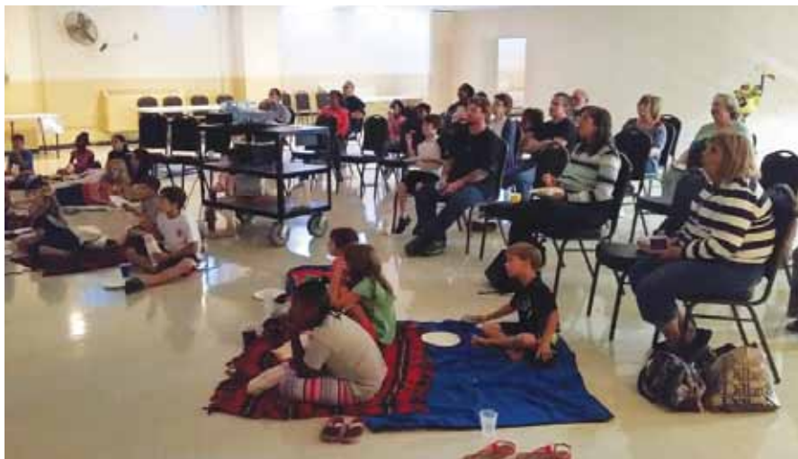
Everyone enjoyed the movie Up, a great story about older and younger generations learning from each other.

Our Lady of the Lake parish is launching a new grandparents ministry – and what better way to kick it off than with a party! Three generations came together for a movie, treats and fun, with more than 40 people gathering in the church hall. It was